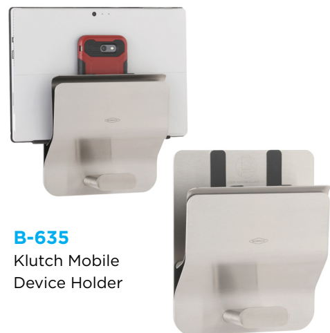
B-635 Klutch Mobile Device Holder

For a complete listing of products and supporting documents, see bobrick.com .