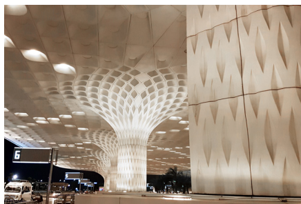
Mumbai International Airport, India