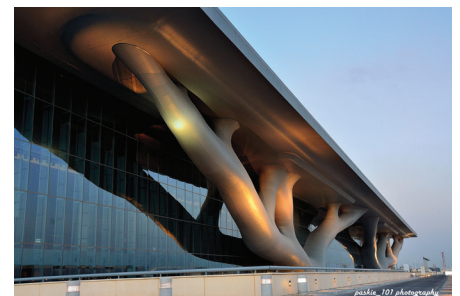
National Convention Centre, Qatar