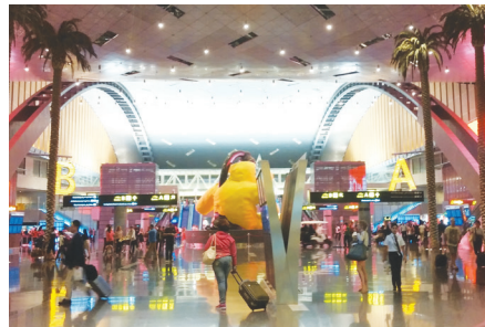
Hamad Airport, Qatar