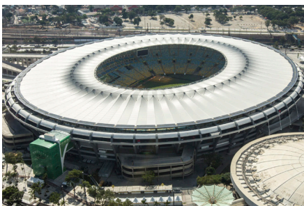
Maracana Stadium, Brazil