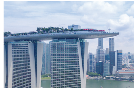
Marina Bay Sands Hotel, Singapore