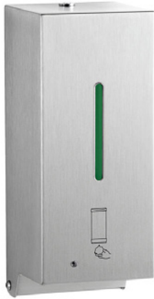
B-2013 Automatic Wall-Mounted Bulk Foam Soap Dispenser